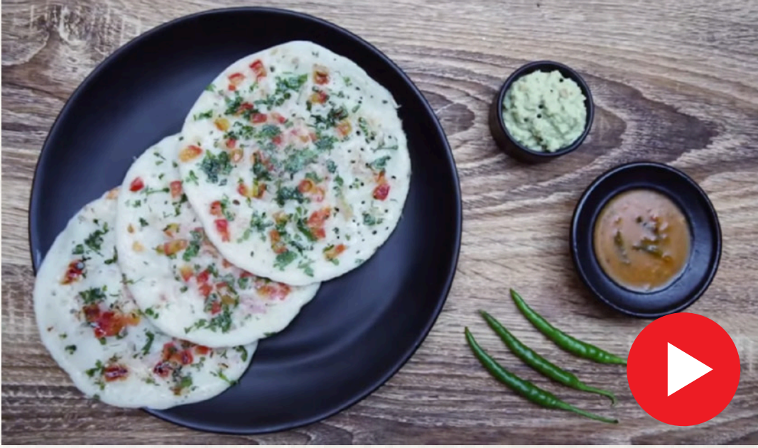
Butter Onion Tomato Uttapam