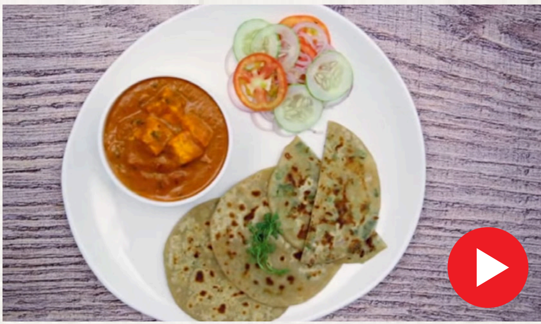
Vegetable Cheese Stuffed Paratha