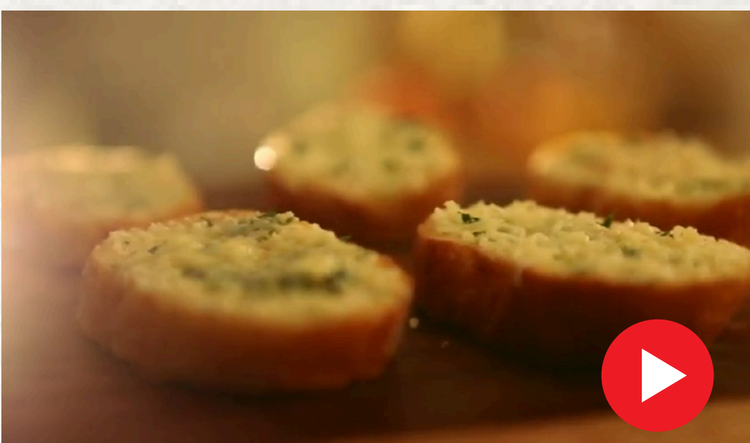
Garlic Bread With Cheese