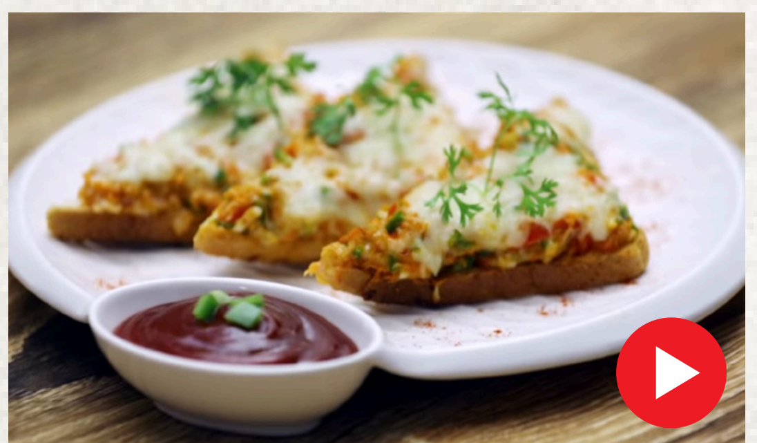
Chilli Cheese Toast