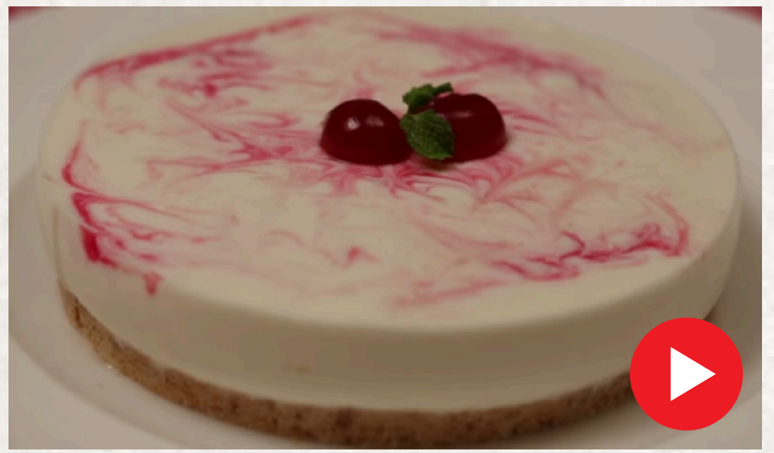
Cold Cheese Cake