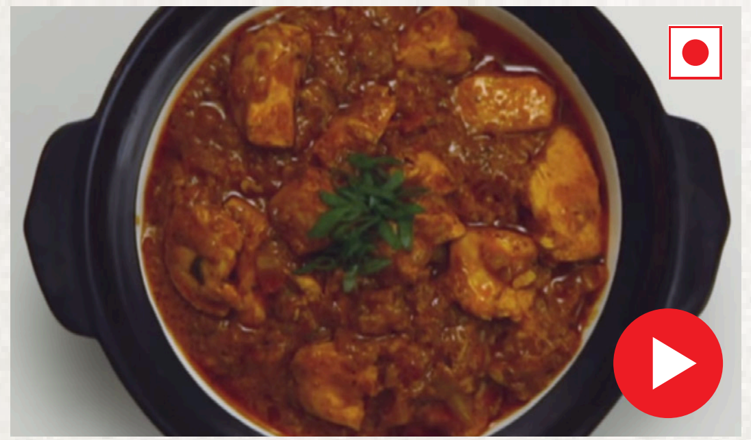
Chicken Tikka Masala