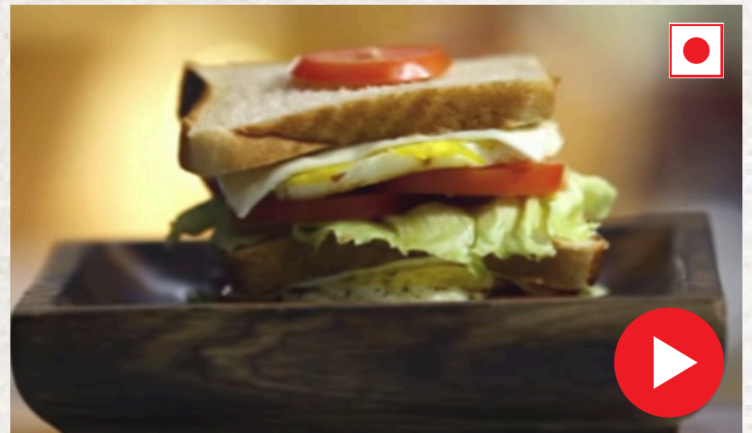
Fried Egg Cheese Sandwich