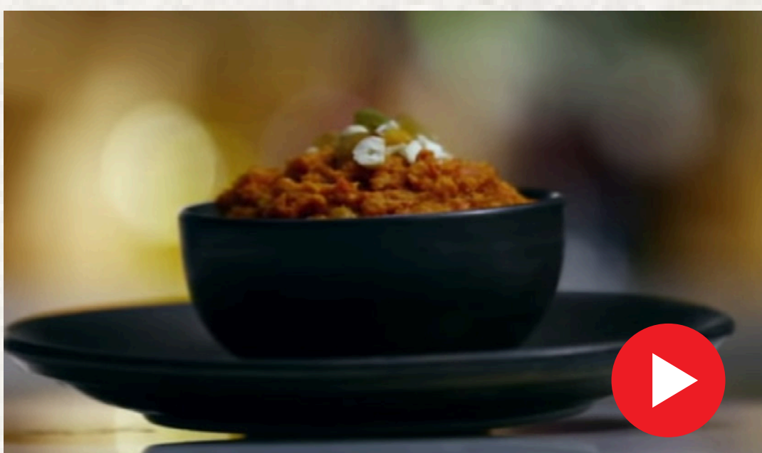
Gajar Ka Halwa