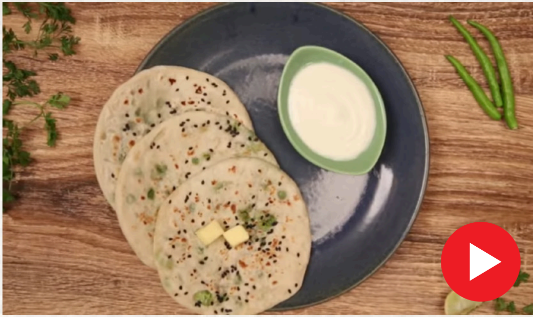
Mattar Paneer Kulcha