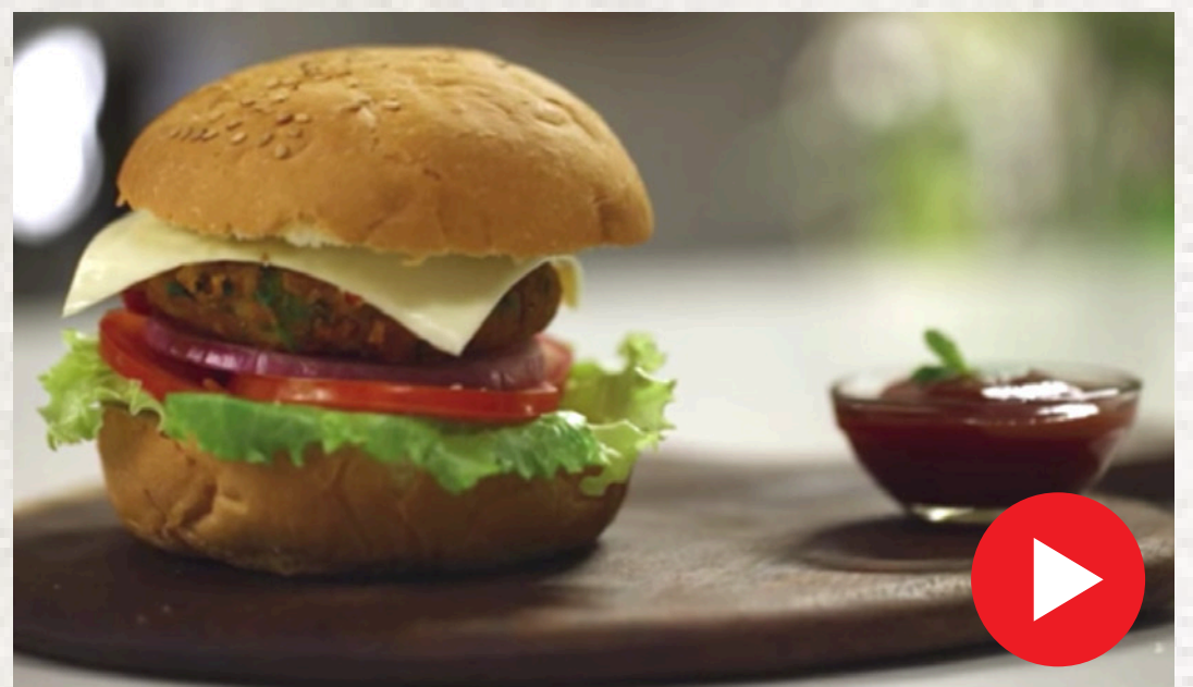
Veg Cheese Burger