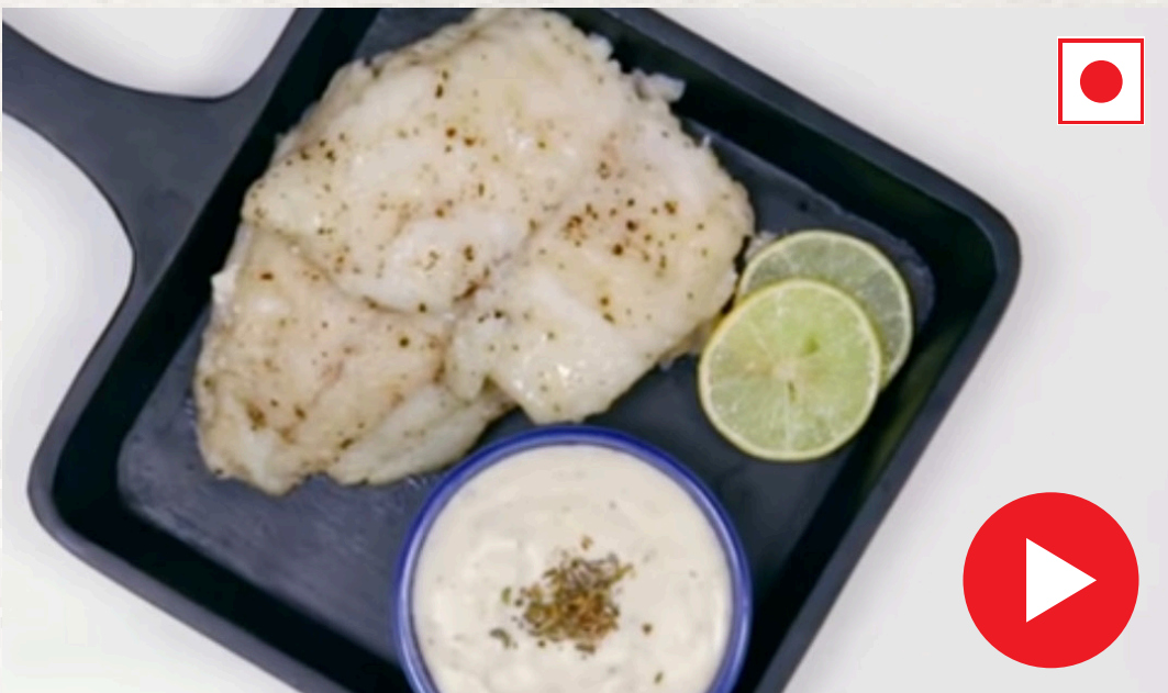
Fish With Garlic & Chesse Sauce