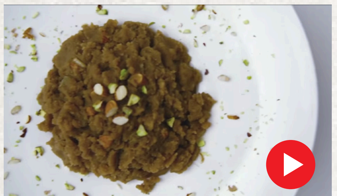
Aate Ka Halwa