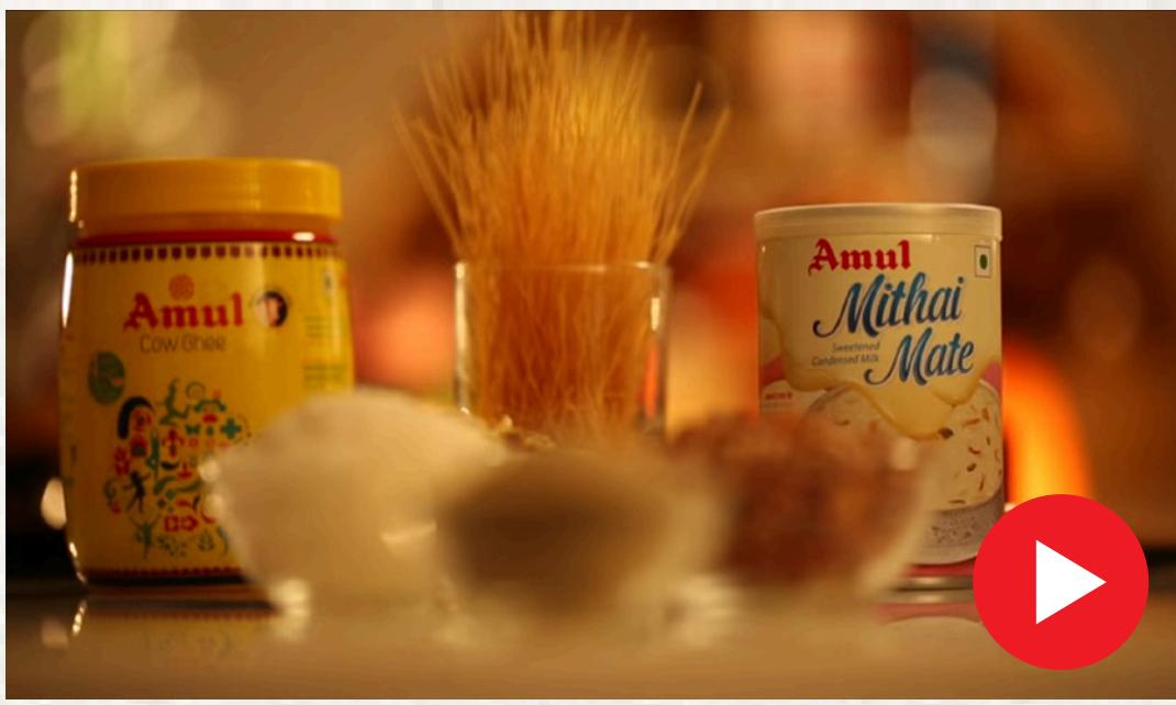
Sevyan Ki Kheer