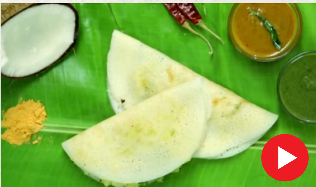
Cheese Masala Dosa