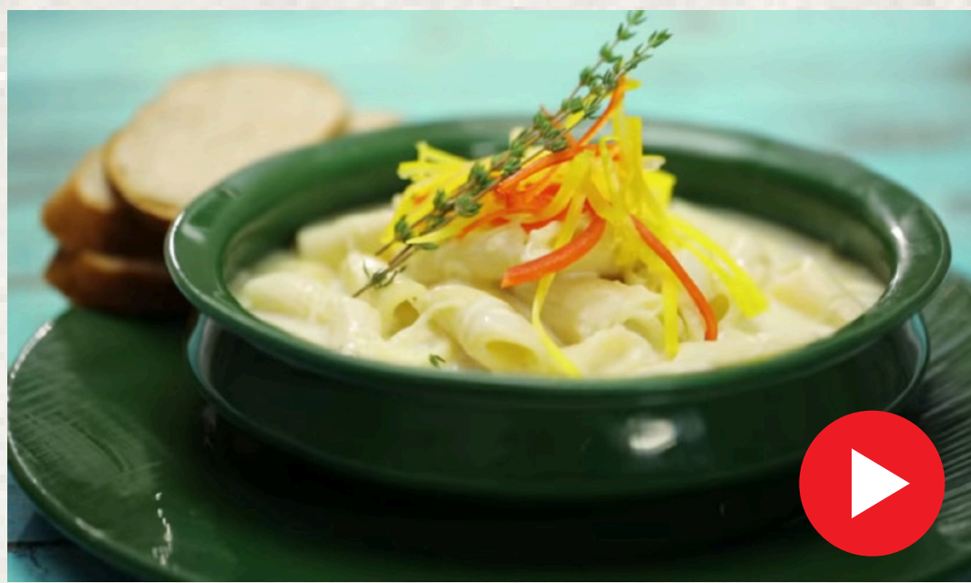
White Sauce Pasta