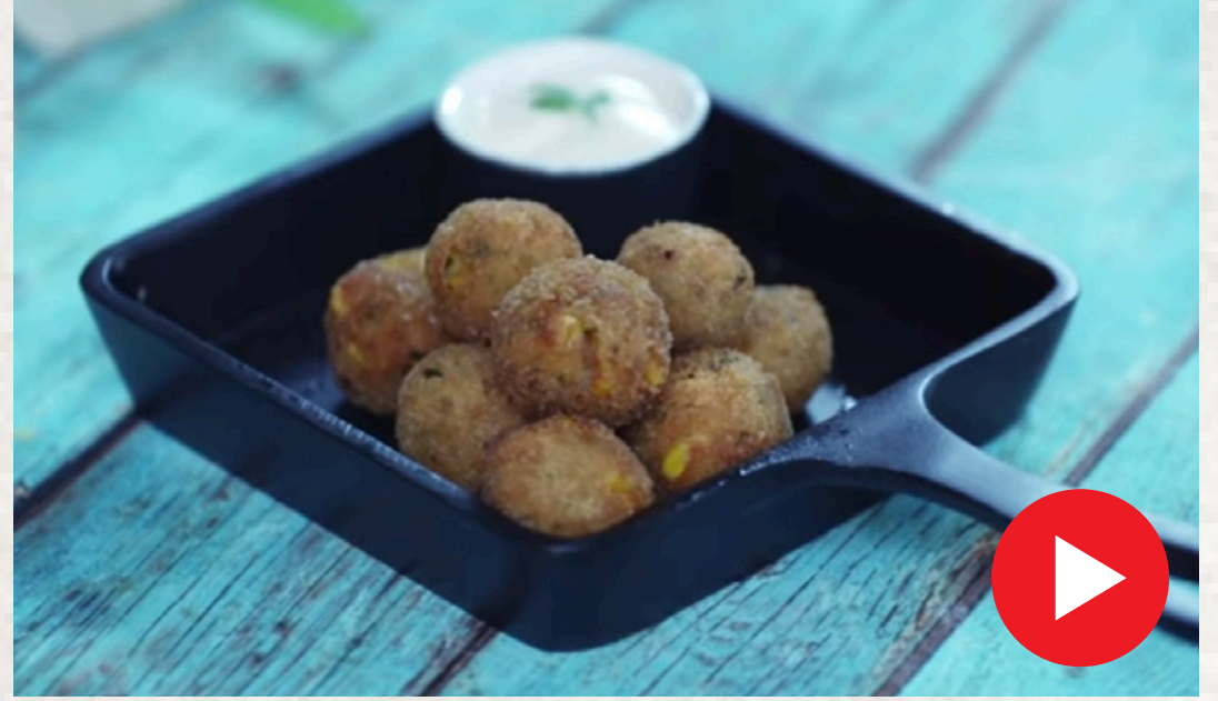
Cheese Corn Balls