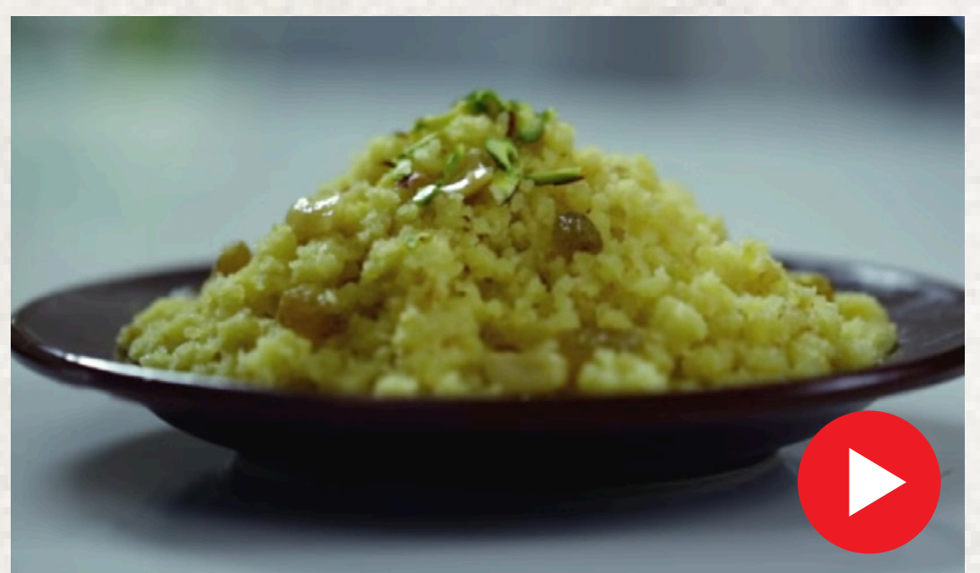
Milk Rava Kesari Halwa