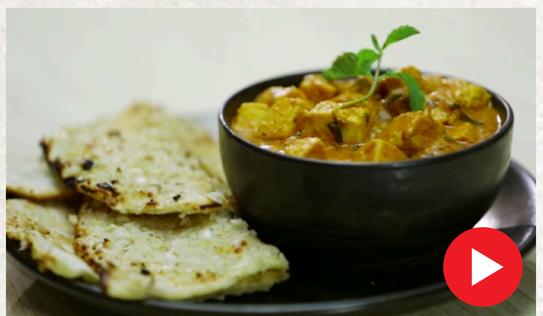
Paneer Tikka Masala