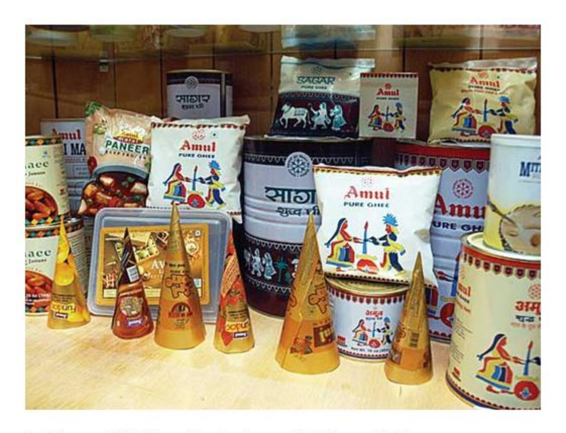
Amul: Turnover of GCMMF has registered quantum growth of 238 per cent in last seven years

BS Reporter | Ahmedabad June 15, 2017 Last Updated at 17:35 IST